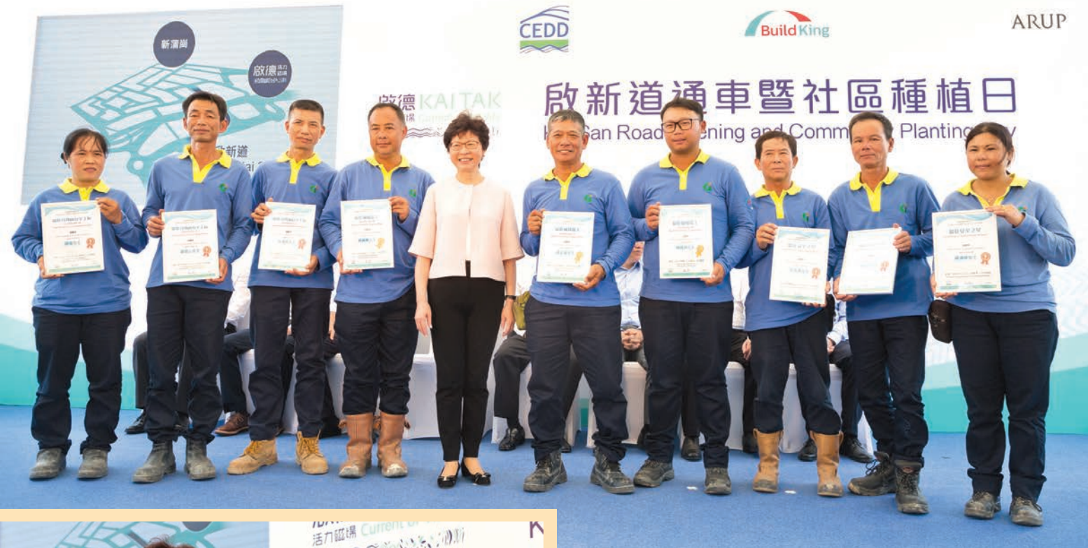
行政長官與獲頒工地安全獎得主合照 Group photo of the Chief Executive with winners of site safety awards