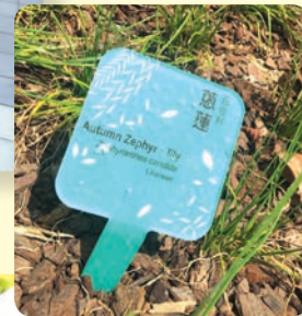
植物名牌 Plant tag