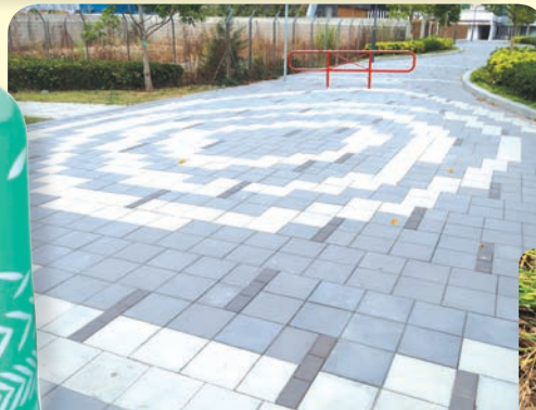
行人路地磚圖案 Footpath paving pattern