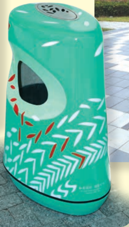
垃圾筒 Rubbish bin