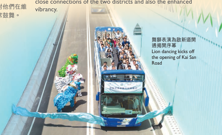
舞獅表演為啟新道開通揭開序幕 Lion dancing kicks off the opening of Kai San Road

林太與眾嘉賓在種植活動後乘坐開篷巴士前往啟新道主持開通儀式。隨着鑼鼓聲敲響，精彩的舞獅表演為啟新道開通揭開序幕。接着，巴士徐徐駛過彩帶，沿啟新道往來啟德與新蒲崗，見證了兩區的緊密連繫，為社區增添發展動力。