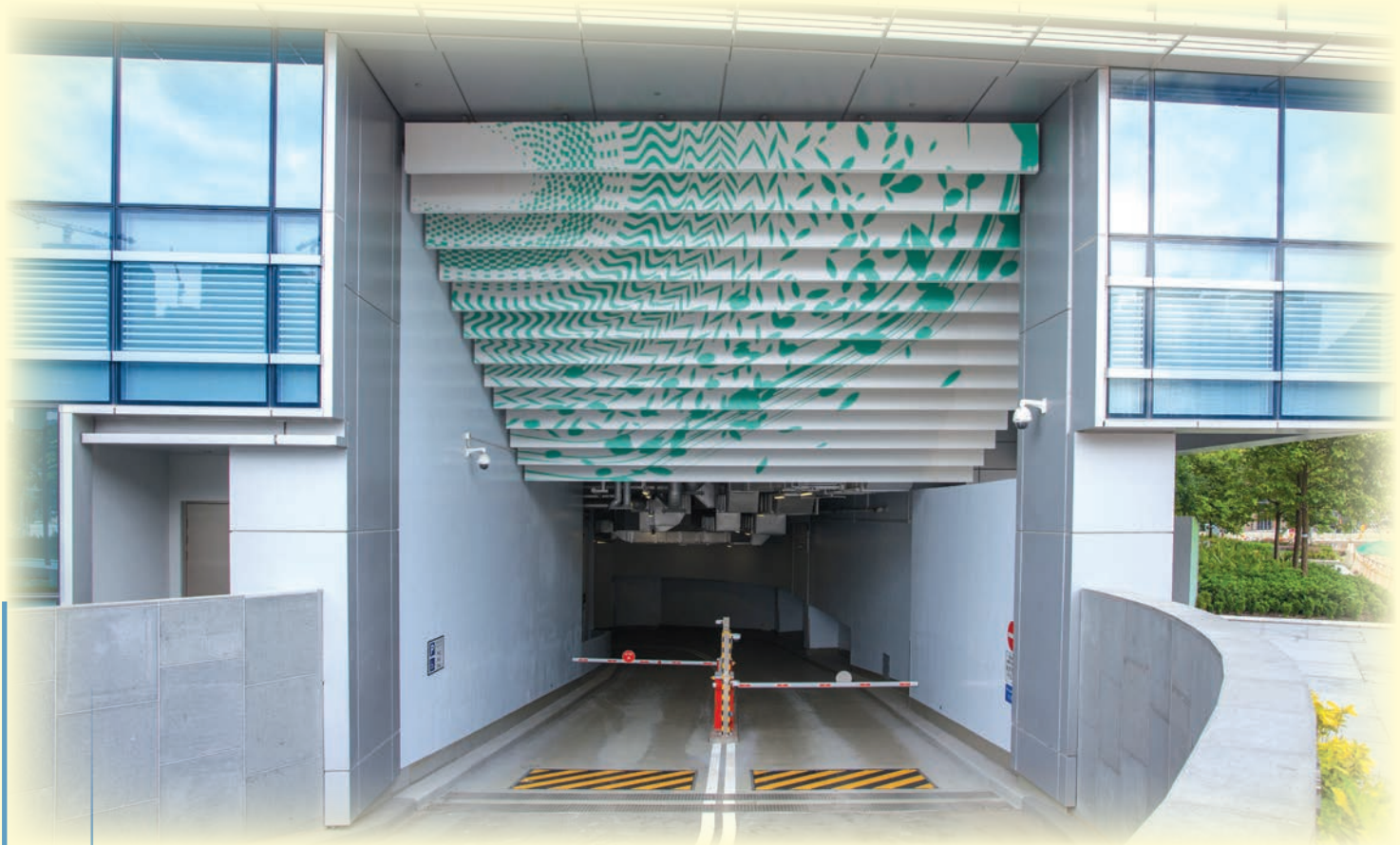
工業貿易大樓停車場出入口 Car park entrance/exit at Trade and Industry Tower

The new carriageway, Kai San Road, around 570m in length, is one of the important infrastructures in the KTD Area. It runs across Prince Edward Road East and connects Concorde Road in Kai Tak and Tsat Po Street in San Po Kong. As the name suggests, Kai San Road combines the first word of the two districts, “Kai” and “San” to bring out the strong connectivity between the two districts, as well as the synergy generated to the benefits of the residents. Kai San Road was open at 11:59 pm on 16 August.