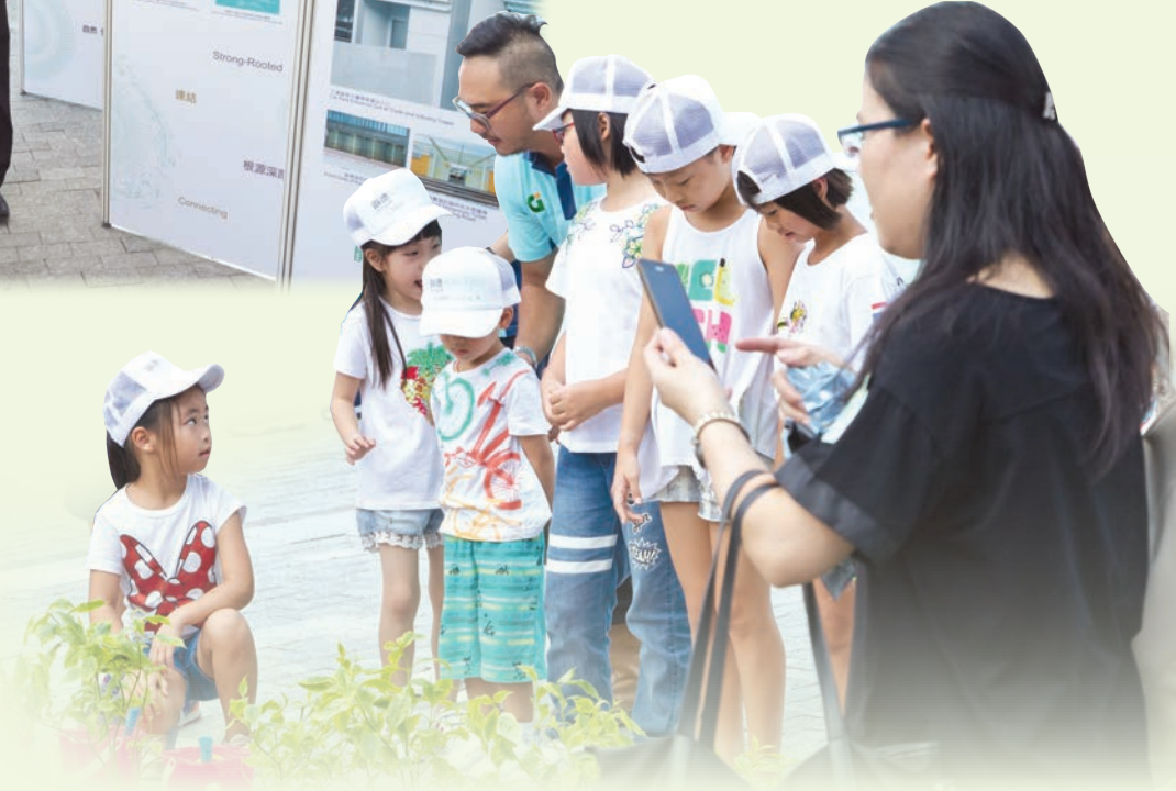
工程團隊人員的子女一同參與種植 Children of project teams members participate in the tree planting