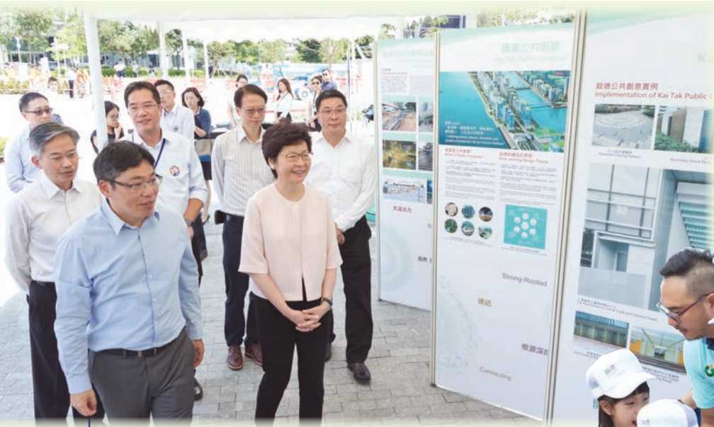
土木工程拓展署署長向行政長官介紹啟德的公共創意品牌 The Director of Civil Engineering and Development presents Kai Tak's Public Creatives branding to the Chief Executive