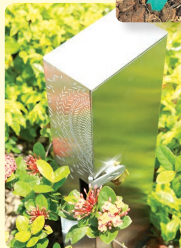
路邊供水柱 Road side water points

Following the developments in Kai Tak, the unique brand of “Current of Vitality” is incorporated in various infrastructures, temporary site hoardings, street name poles, footpath paving, bollards, road side water points and rubbish bins, as well as government buildings. The signature color and logo of Public Creatives have also been applied on the sidewalls of Kai San Road to enhance public’s understanding of the branding of Kai Tak, its characteristics and also vitality. The brand will also be adopted in various street furniture, such as mailboxes, pedestrian island railings, etc. This will enhance the community’s sense of belonging and will bring forward a fresh image of Kai Tak to the public.