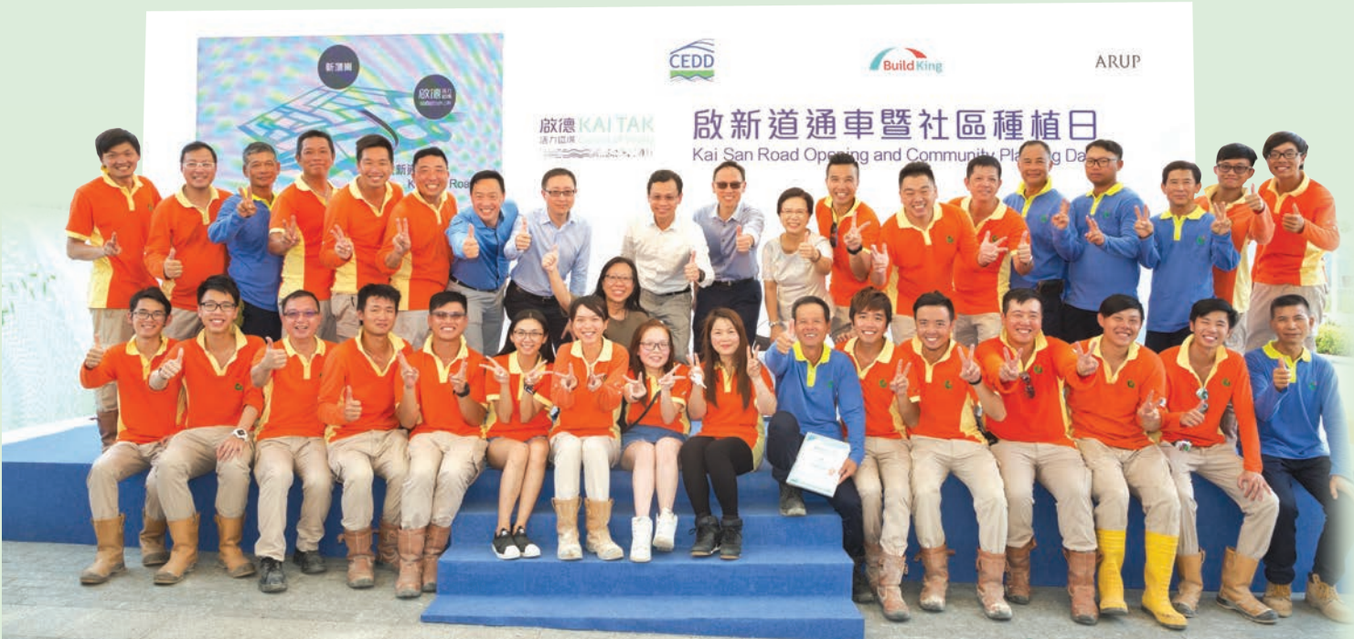
工程團隊合照 Group photo of project teams