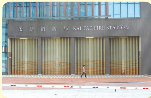
啟德消防局前閘 Front gate of Kai Tak Fire Station

隨着啟德的發展，這個獨有的活力磁場品牌亦陸續展現於區內的基礎設施、工程臨時圍板、街名柱、行人路地磚、行人護柱、路邊供水柱和垃圾筒等，以至政府設施大樓內。當下開通的啟新道出入口的車道兩旁，亦特別展示了啟德公共創意的品牌顏色和活力磁場的標誌，以加強公眾對品牌的認識，帶出啟德新區的特色和活力。至於其他融入啟德品牌的街道設施，包括郵箱、行人島欄杆等，亦會逐步落成，以增添市民對啟德的歸屬感，並提升社區凝聚力，讓大眾感受到啟德的新貌。