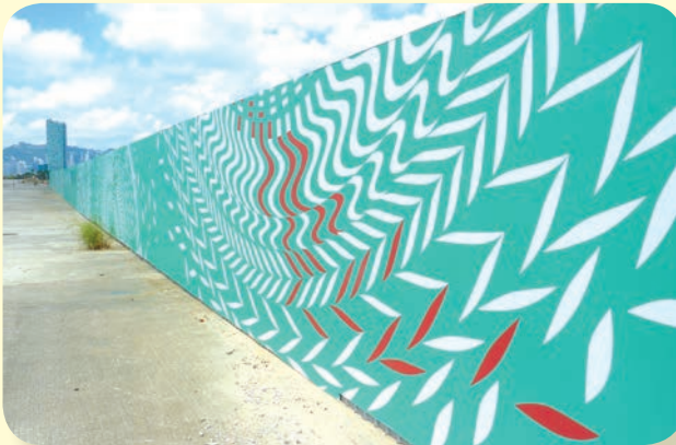
工地臨時圍板 Temporary site hoarding

隨着啟德的發展，這個獨有的活力磁場品牌亦陸續展現於區內的基礎設施、工程臨時圍板、街名柱、行人路地磚、行人護柱、路邊供水柱和垃圾筒等，以至政府設施大樓內。當下開通的啟新道出入口的車道兩旁，亦特別展示了啟德公共創意的品牌顏色和活力磁場的標誌，以加強公眾對品牌的認識，帶出啟德新區的特色和活力。至於其他融入啟德品牌的街道設施，包括郵箱、行人島欄杆等，亦會逐步落成，以增添市民對啟德的歸屬感，並提升社區凝聚力，讓大眾感受到啟德的新貌。