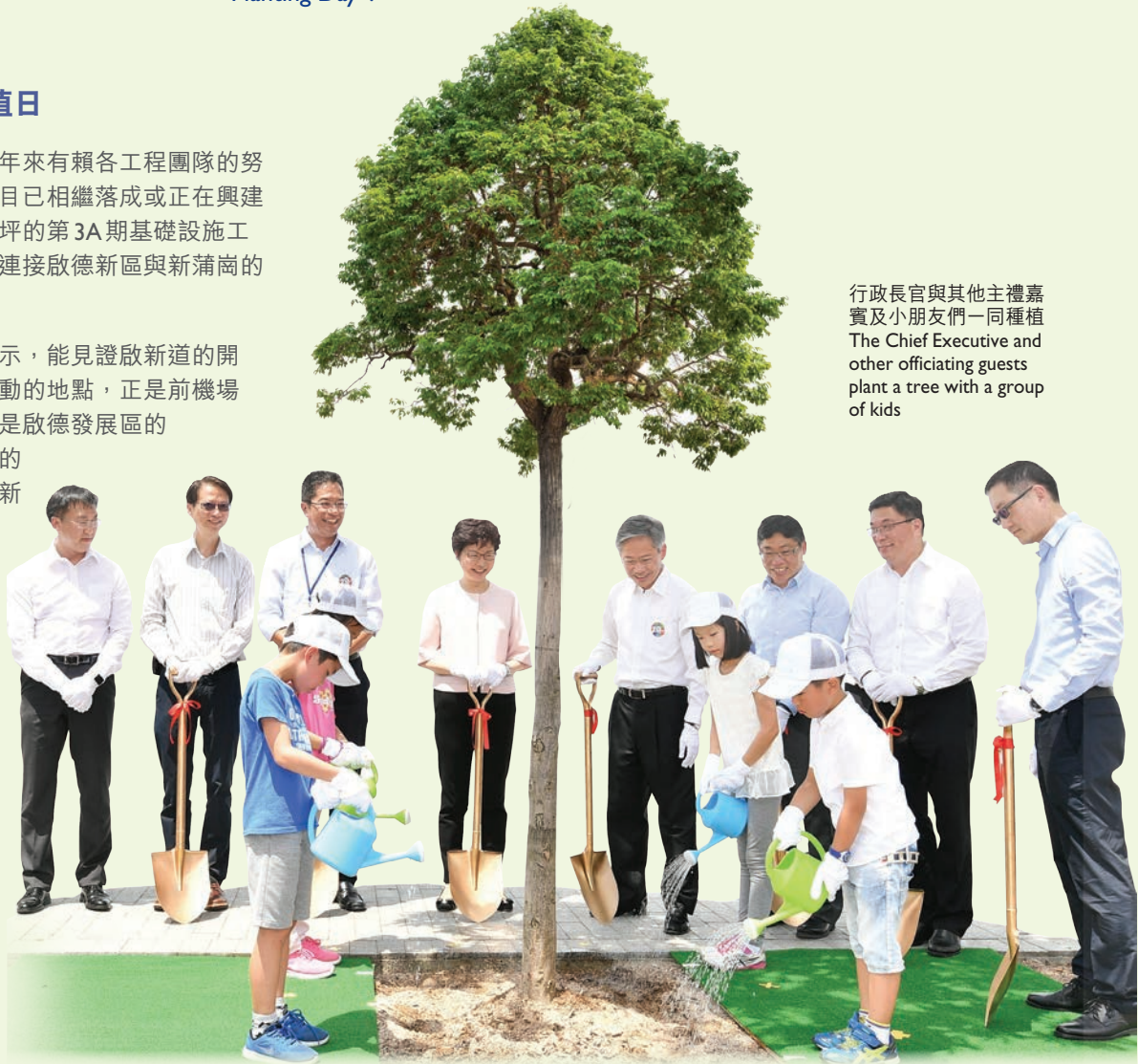
行政長官與其他主禮嘉賓及小朋友們一同種植 The Chief Executive and other officiating guests plant a tree with a group of kids

林太在啟用活動上致辭時表示，能見證啟新道的開通，別具意義。舉行啟用活動的地點，正是前機場北面停機坪的原址，亦將會是啟德發展區的中心。正因如此，發展完善的交通配套設施，至關重要。新落成的啟新道，配合已規劃的行人配套設施，包括兩條跨越太子道東的園景美化高架行人道，以及三條已優化的行人隧道，都有助啟德與周邊地區建立更緊密的連繫，推動九龍東成為第二個核心商業區，從而促進香港的長遠經濟發展。