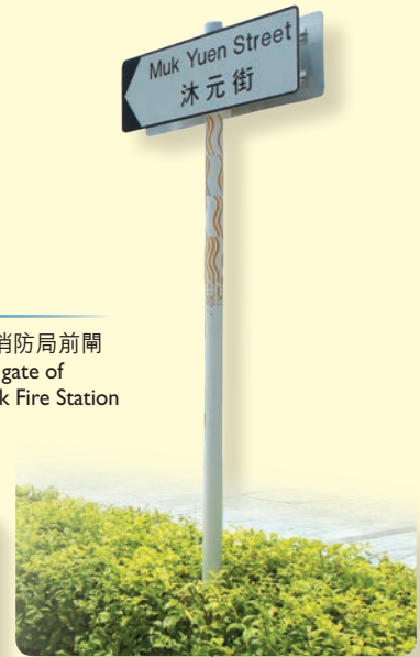
街名柱 Street name pole