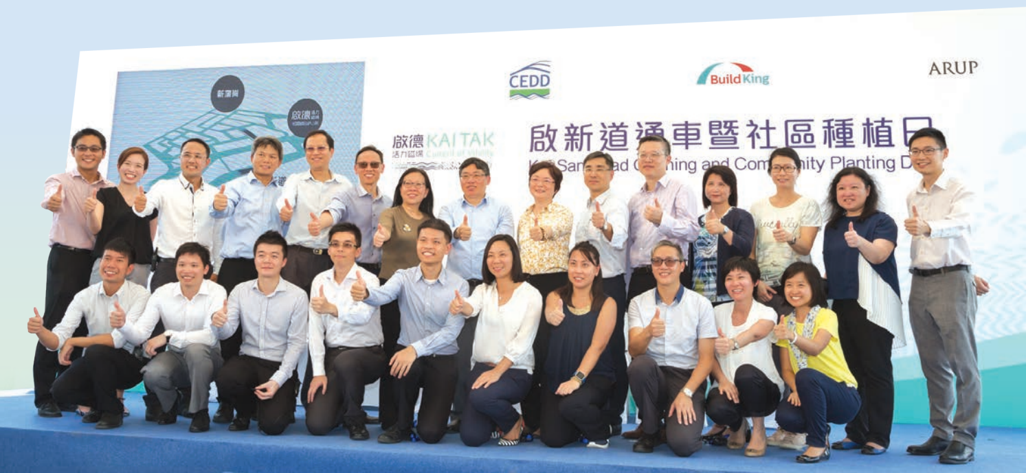
土木工程拓展署署長與九龍拓展處同事合照 Group photo of Director of Civil Engineering and Development with colleagues of the Kowloon Development Office

嘉賓乘坐巴士到達啟新道新蒲崗段出入口，見證了兩區的緊密連繫 Guests hop on the buses arriving the San Po Kong access of Kai San Road, witnessing the close connections of the two districts